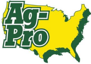
Sponsor of YEDA High Point Rider Awards

YEDA would like to thank all of the sponsors for their support of the Scholarship Incentive Fund and YEDA Riders. We ask that you support them with your patronage.