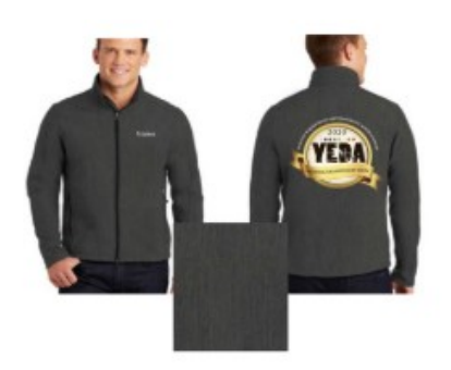
Black Available in Mens, Womens And Youth sizes