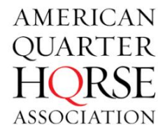
Proudly Offering a $1750 High School Scholarship