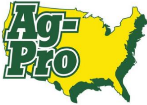
Sponsor of YEDA High Point Rider Awards

YEDA would like to thank all of the sponsors for their support of the Scholarship Incentive Fund and YEDA Riders. We ask that you support them with your patronage.