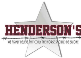
Sponsor of YEDA High Point Rider Awards