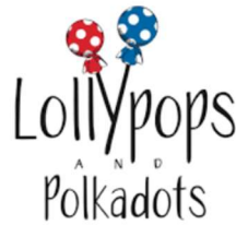
Sponsor of YEDA High Point Pearl Rider Awards