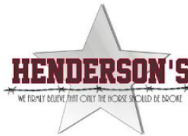
Sponsor of YEDA High Point Rider Awards