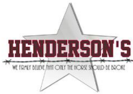
Sponsor of YEDA High Point Rider Awards