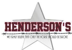
Sponsor of YEDA High Point Rider Awards