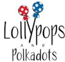
Sponsor of YEDA High Point Pearl Rider Awards