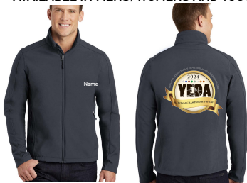
BATTLESHIP GRAY AVAILABLE IN MENS, WOMENS AND YOUTH