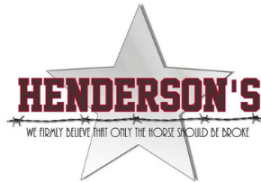
Sponsor of YEDA High Point Rider Awards