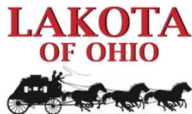
Proudly Offering a $1000 Senior Achievement Scholarship