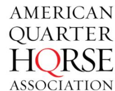
Proudly Offering a $1750 High School Scholarship