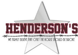
Sponsor of YEDA High Point Rider Awards