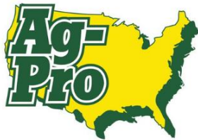
Sponsor of YEDA High Point Rider Awards

YEDA would like to thank all of the sponsors for their support of the Scholarship Incentive Fund and YEDA Riders. We ask that you support them with your patronage.