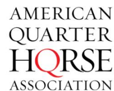
Proudly Offering a $1750 High School Scholarship