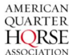
Proudly Offering a $1750 High School Scholarship