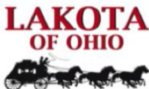
Proudly Offering a $1000 Senior Achievement Scholarship