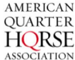
Sponsor of YEDA High Point Rider Awards