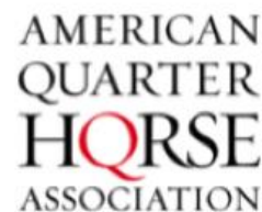
Proudly Offering a $1750 High School Scholarship