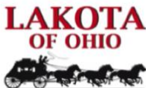
Proudly Offering a $1000 Senior Achievement Scholarship