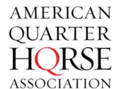
Proudly Offering a $1750 High School Scholarship