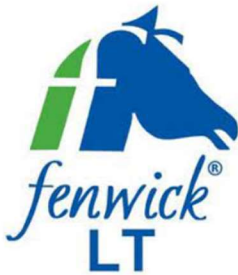
Sponsor of YEDA Horse of the Day Awards