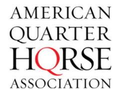
Proudly Offering a $1750 High School Scholarship