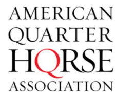
Proudly Offering a $1750 High School Scholarship