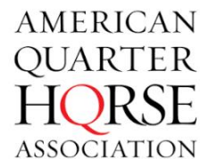
Proudly Offering a $1750 High School Scholarship