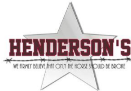
Sponsor of YEDA High Point Rider Awards