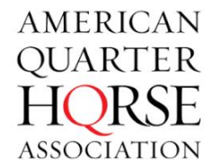
Proudly Offering a $1750 High School Scholarship