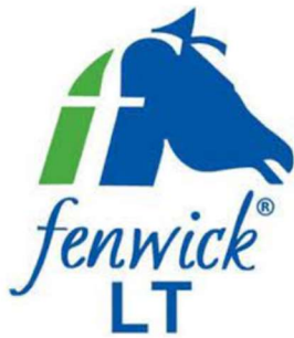
Sponsor of YEDA Horse of the Day Awards