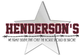
Sponsor of YEDA High Point Rider Awards