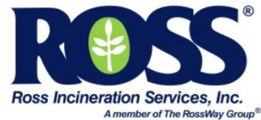
Proudly Offering a $2000 Senior and $1000 Junior Achievement Scholarships