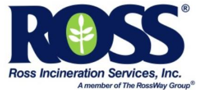
Proudly Offering a $2000 Senior and $1000 Junior Achievement Scholarships