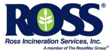
Proudly Offering a $2000 Senior and $1000 Junior Achievement Scholarships