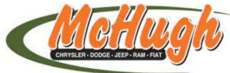
Proudly Offering a $1000 Senior Achievement Scholarship