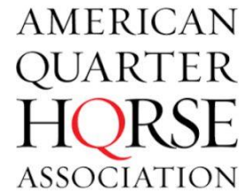
Sponsor of YEDA High Point Rider Awards