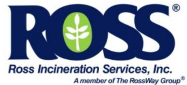
Proudly Offering a $2000 Senior and $1000 Junior Achievement Scholarships