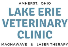
MAGNAWAVE & LASER THERAPY