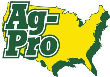
Sponsor of YEDA High Point Rider Awards

YEDA would like to thank all of the sponsors for their support of the Scholarship Incentive Fund and YEDA Riders. We ask that you support them with your patronage.