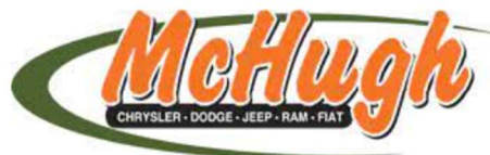
Proudly Offering a $1000 Senior Achievement Scholarship