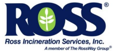
Proudly Offering a $2000 Senior and $1000 Junior Achievement Scholarships