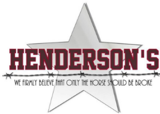
Sponsor of YEDA High Point Rider Awards