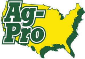
Sponsor of YEDA High Point Rider Awards

YEDA would like to thank all of the sponsors for their support of the Scholarship Incentive Fund and YEDA Riders. We ask that you support them with your patronage.