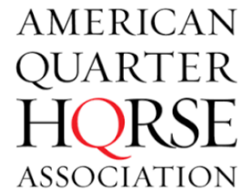
Sponsor of YEDA High Point Rider Awards