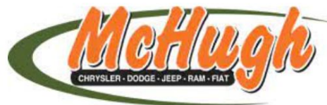
Proudly Offering a $1000 Senior Achievement Scholarship