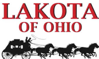
Proudly Offering a $1000 Senior Achievement Scholarship