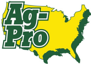
Sponsor of YEDA High Point Rider Awards

YEDA would like to thank all of the sponsors for their support of the Scholarship Incentive Fund and YEDA Riders. We ask that you support them with your patronage.