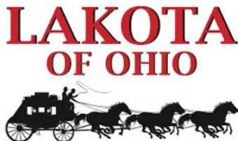
Proudly Offering a $1000 Senior Achievement Scholarship