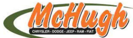
Proudly Offering a $1000 Senior Achievement Scholarship