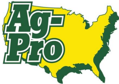
Sponsor of YEDA High Point Rider Awards

YEDA would like to thank all of the sponsors for their support of the Scholarship Incentive Fund and YEDA Riders. We ask that you support them with your patronage.