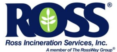
Proudly Offering a $2000 Senior and $1000 Junior Achievement Scholarships