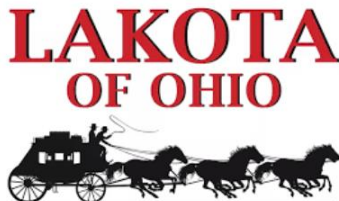
Proudly Offering a $1000 Senior Achievement Scholarship