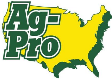
Sponsor of YEDA High Point Rider Awards

YEDA would like to thank all of the sponsors for their support of the Scholarship Incentive Fund and YEDA Riders. We ask that you support them with your patronage.