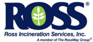
Proudly Offering a $2000 Senior and $1000 Junior Achievement Scholarships