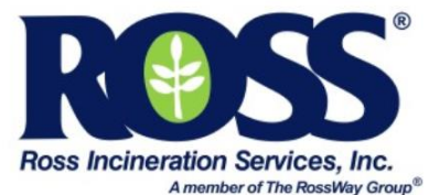
Proudly Offering a $2000 Senior and $1000 Junior Achievement Scholarships