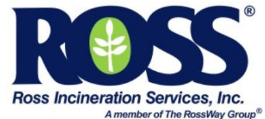
Proudly Offering a $2000 Senior and $1000 Junior Achievement Scholarships